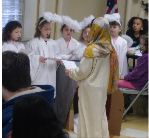
Grades K & 1 presented an assembly last weekend for the IC Religious Ed. classes .... "He Is Risen."